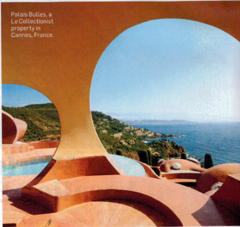
Palais Bulles, a Le Collectionist property in Cannes, France.

DID YOU KNOW? > Many hotels, including the Four Seasons Costa Rica or Vail's Arrabelle, have villas on property—with amenities like spa access and turndown service.